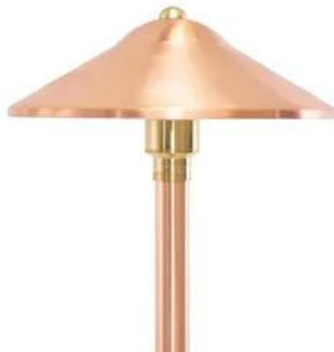
VOLT® Max Spread Copper Path & Area Light

Substantially proportioned for wider and longer paths, the large shade with a shallow angle and tall post all equate to wider regions of illumination. The Max Spread Area Path light can save you money by reducing the number of lights needed. Includes the VOLT® Hammer® Stake. Various mounting options available. 16 foot diameter beam spread.