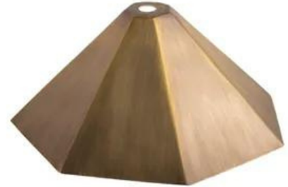
VOLT® Brass Parasol Hat (Bronze)

Shade ONLY, does not include lamp housing or finial. Solid Brass Construction. Designed to mount on VOLT stems.