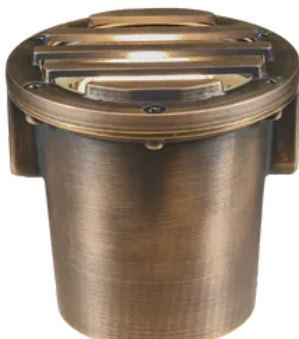
VOLT® Salty Dog MR16 Grated In-Grade Light

Our most advanced, fully submersible, lamp-ready in-grade light. This model features a fixed glare guard to control direct glare. The VOLT® Salty Dog MR16 In-Grade Light is a professional-grade, completely waterproof in-grade light with a cold forged brass body, pressure fit gaskets, new watertight wire glands, and lamp ready capability for a wide array of LED MR16 lamps. Our line of "Salty Dog" in-grade lights are the first of its kind that can be fully submerged without risk of damaging the fixture.