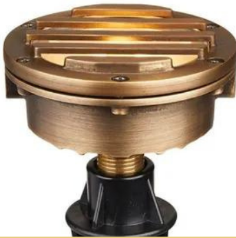
VOLT® Salty Dog Single Source Integrated LED Grated In-Grade Light

Introducing our most advanced fully submersible, single source integrated LED in-grade light. This model features a fixed shielded glare guard to control direct glare. We've redesigned the in-grade light from the ground up - starting with a cold forged brass body, pressure fit gaskets, watertight wire glands, and the latest integrated LED technology. Our Salty Dog in-grade lights are the first of their kind that can be fully submerged without risk of damaging the fixture. Finally, a fixture that you can install with the utmost confidence in areas prone to flooding!