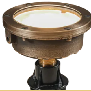
VOLT® Salty Dog Single Source Integrated LED In-Grade Light

Introducing our most advanced, fully submersible, integrated LED well light. This professional-grade low voltage well light is great for uplighting trees, columns, walls and more. Its adjustable, fully-integrated LED internal lamp housing can move up or down, and provides a directional angle for precise aiming. This completely waterproof fixture features a cold forged brass faceplate with a reinforced PVC canister.