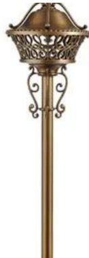
VOLT® ShadowMaster Integrated LED Brass Path Light (Bronze)

Traditional curved-style brass path light now with extra adjustable lamp shade. Durable brass construction. Reflective white enamel inside shade for maximum reflection and light/lumen output. Utilizes LED G4 Bi-Pin bulbs. Ideal for direct illumination along paths and in gardens.