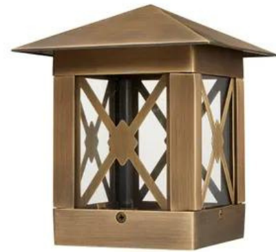
VOLT® Guardsman Brass LED Post-Top Light (Bronze)

Its four louvered domed construction houses an adjustable MR16 bulb socket than can project up to a 10" circle of uniform illumination.