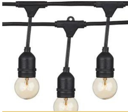
VOLT® 120V E26 Bistro String Lights (50ft)

Designed for indoor or outdoor commercial applications - for events or permanent use. VOLT® bistro string lights are powered by 120V and features replaceable LED bulbs. These weather-resistant globe lights are ideal for hanging and draping between trees, under canopies, verandas, or lanais. Features sealable plugs for extra longevity.