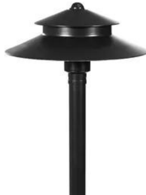
VOLT® Stratum Brass Two-Tier Path & Area Light (Black)

This Two-Tier Path & Area Light is a high-quality outdoor lighting fixture that projects a wide circle of uniform illumination. With a 9" diameter shade, this is the little brother of the 12" Stratum. Both fixtures have clean, modern lines with a traditional pagoda-like shape - ideal for gardens with Asian themes, but also works for properties with landscape structures such as gazebos, pergolas and arbors.