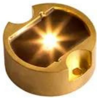
VOLT® BuddyPro™ Brass LED Puck Light (2200K - Candle Light Edition)

Designed to mount on the top of a square 4" x 4" post, this fixture has sturdy brass construction with antique bronze finish. Commonly used for decks, docks and fences. It projects a compelling pattern of illumination onto surrounding surfaces.