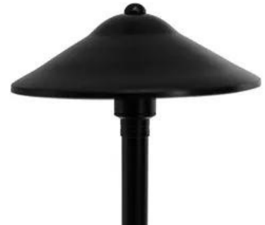
VOLT® Max Spread Brass Path & Area Light (Black)

Substantially proportioned for wider and longer paths, the large shade with a shallow angle and tall post all equate to wider regions of illumination. The Max Spread Area Path light can save you money by reducing the number of lights needed. Includes the VOLT® Hammer® Stake. Various mounting options available. 16 foot diameter beam spread.