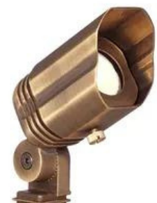
VOLT® Lusitano Mini Cast Brass Spotlight (Bronze)

VOLT® engineers started with a heavy, cast brass fixture, then added heat sinks, a fully adjustable glare guard, a large toothed knuckle and a unique industrial design. This spotlight will be a permanent fixture in your landscape, no matter the environment.