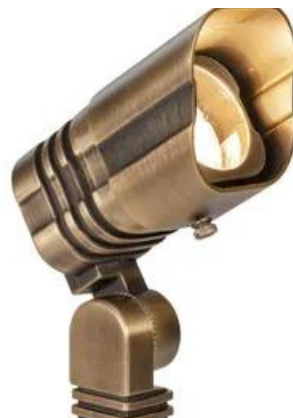
VOLT® Lusitano Cast Brass Spotlight (Bronze)

Designed to primarily be used with our 9W LED MR16 bulb (70W Halogen Replacement), this fixture is specially designed for high lumen output. The recommended bulb features a special thermal foldback design which will help dissipate heat by gradually dimming if needed. Features toolless adjustability for precision light control.