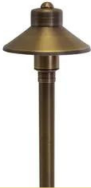
VOLT® Flat Hat Shade Brass Path & Area Light (5" Shade)

A popular and classic style, this solid copper path/area light patinas beautifully as it ages.