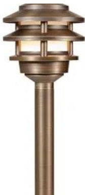
VOLT® Premier Pagoda Brass Path Light

The key difference between the Brass Flat Hat 3" Light and this fixture is the mini stem, making the overall height of the fixture 15". An excellent choice when you want a very low path & area light. Features a 3-foot spread of light. Various mounting options available.