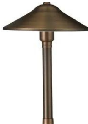
VOLT® Max Spread Mini Brass Path & Area Light

High quality path/area light. Simple, yet attractive design. Premium grade internal components. Includes Hammer® Stake. Various mounting options available. 12 foot spread of light.