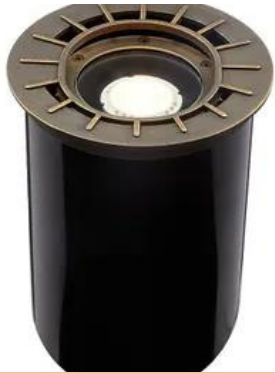
VOLT® Salty Dog MR16 Well Light

Our most advanced, fully submersible, lamp-ready well light. The VOLT® Salty Dog MR16 Well Light is a professional-grade, completely waterproof well light that's great for illuminating trees, columns, walls and more. Constructed of cold forged brass with a reinforced PVC canister, this low-profile fixture features an adjustable lamp-ready internal housing that can move up or down, and provides a directional angle for precise aiming.