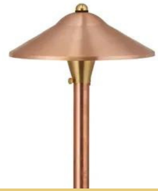
VOLT® Max Spread Mini Copper Path & Area Light

Substantially proportioned for wider and longer paths, the large shade with a shallow angle and tall post all equate to wider regions of illumination. The Max Spread Mini Area Path light has an 8-foot diameter spread of light - the largest of all our mini path and area lights. Various mounting options available.