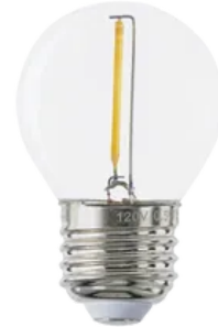
VOLT® 120V G45 0.5W LED Globe Bulb (10 Watt Halogen Replacement)

Designed for indoor or outdoor commercial applications - for events or permanent use. VOLT® bistro string lights are powered by 120V and features replaceable LED bulbs. These weather-resistant globe lights are ideal for hanging and draping between trees, under canopies, verandas, or lanais. Features sealable plugs for extra longevity.