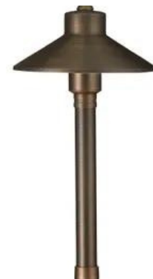
VOLT® Mini Flat Hat Brass Path & Area Light (7" Shade)

The key difference between the Copper Conehead Path & Area Light and the mini version is the 8" tall stem, making the overall height of the fixture 12". An excellent choice when you want a very low path & area light. Features a 6-foot spread of light . Various mounting options available.