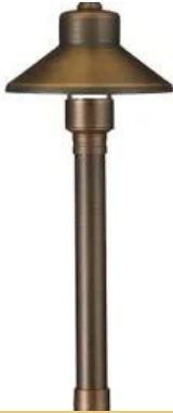
VOLT® Mini Flat Hat Brass Path & Area Light (5" Shade)

Miniature version of popular Brass Flat Hat 5" Path & Area Light is ideal for paths, driveways, flower beds and patios.