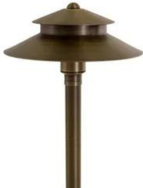
VOLT® Stratum Brass Two-Tier Path & Area Light (9" Shade)

Tiered pagoda-like fixture with durable brass construction and adjustable brightness.