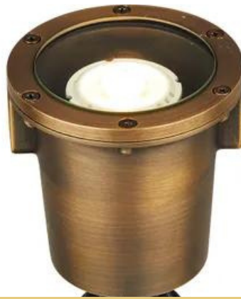
VOLT® Salty Dog MR16 In-Grade Light

Our most advanced, fully submersible, lamp-ready well light. The VOLT® Salty Dog MR16 Well Light is a professional-grade, completely waterproof well light that's great for illuminating trees, columns, walls and more. Constructed of cold forged brass with a reinforced PVC canister, this low-profile fixture features an adjustable lamp-ready internal housing that can move up or down, and provides a directional angle for precise aiming.