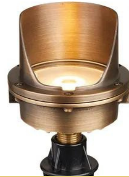
VOLT® Salty Dog Single Source Integrated LED Shielded In-Grade Light

We've redesigned the in-grade light from the ground up - starting with a cold forged brass body, pressure fit gaskets, new watertight wire glands and the latest in integrated LED technology. Our line of Salty Dog in-grade lights are the first of their kind that can be fully submerged without risk of damaging the fixture. Finally, a fixture that you can install with the utmost confidence in areas prone to flooding! Our wire glands ensure that water cannot get into the fixture from one of the most common points of failure. Pressure fit gaskets ensure a tight seal that will keep water out of the internal housing.