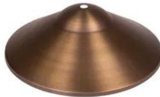
VOLT® Max Spread 9" Hat (Brass with Bronze Finish)

Made from solid cast brass, this heavy duty finial will add elegance to your brass path lights. The bottom is threaded to screw on the path light hat for a quick and easy installation.