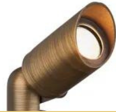
VOLT® Spark Mini Brass Spotlight (Bronze)

Compact and durable, this heavyweight solid cast brass spotlight offers many uses. Uses replaceable MR11 LED bulbs. This fixture is ideal for niche applications such as garden lighting, illuminating statuary or small architectural or landscape features.