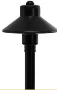
VOLT® Flat Hat Black Brass Path & Area Light (5" Shade)

The fixture provides a generous spread of soft-edged illumination ideal for all types of paths and landscape features. Easy to assemble and install. Various mounting options available. 12 foot spread of light.