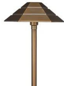
VOLT® Sedona Brass Path & Area Light (Bronze)

The VOLT® Wide Modernelle Path and Area Light is a professional-grade LED fixture with a modern style. Constructed of heavy solid brass, the fixture is a durable lifetime solution to your path lighting needs. Standard 4' lead wire. Includes Hammer® Stake. Various mounting options available.