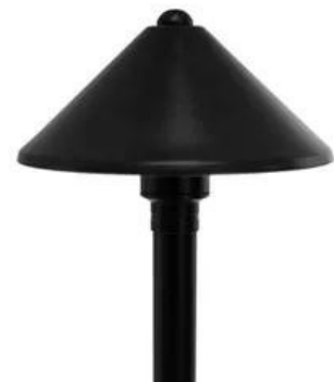
VOLT® Conehead Brass Path & Area Light (Black)

Professional-quality, durable path/area light. Easy to assemble and install. Organic design complements any architectural or landscape feature. Various mounting options available. 12-foot diameter illumination - evenly dispersed and soft-edged.