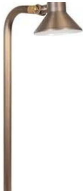
VOLT® G2 Arch Brass Path & Area Light (Bronze)

Traditional curved-style brass path light with adjustable lamp housing.