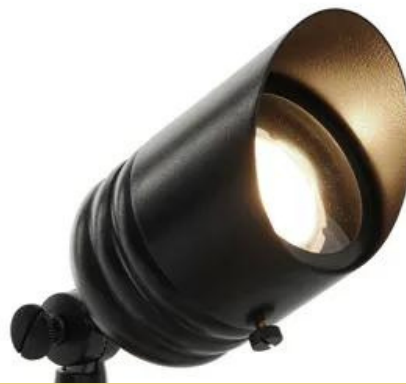
VOLT® G2 Fat Boy Brass Spotlight (Black)

We combined the best features of our most popular spotlights into one premium fixture that features a compact body with fins designed to draw heat away from the LED lamp. Blending performance and durability, this fixture is a designer's dream.