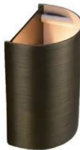
VOLT® Cast Brass Up/Down Integrated LED Deck Light (Bronze)

Very warm 2200K color temperature - designed to mimic the color of candle light and natural fire glow. Extremely compact (1.5" x 0.625") Cree® LED light constructed of solid CNC machined brass - easy to install and conceal. Fully potted and sealed, it can be surface mounted or core drilled. Simple and quick to install, the light requires no maintenance, and is completely waterproof.