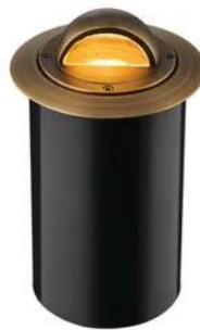
VOLT® Salty Dog MR11 Beacon Brass Well Light (Bronze)

Introducing our most compact, fully submersible, lamp-ready well light. The VOLT® Salty Dog MR11 Well Light is a low voltage outdoor professional-grade well light. Great for up lighting on trees, columns, walls, and anything where a low profile outdoor well light fixture is desired. Featuring an adjustable lamp-ready internal housing that can move up, down and give you a directional angle for precise aiming. Cold forged brass with a reinforced PVC canister. Completely waterproof.