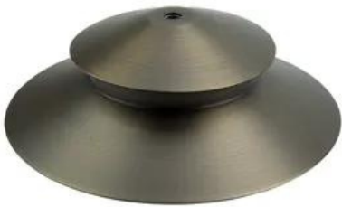
VOLT® Stratum 9" Double Tiered Hat (Brass with Bronze Finish)

Shade ONLY, does not include lamp housing or finial. Solid Brass Construction. Designed to mount on VOLT stems.