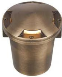
VOLT® Salty Dog MR11 Turret Top Brass In-Grade Light (Bronze)

Introducing our most compact, fully submersible, lamp-ready in-grade light. This model features a fixed, turret top glare guard to control direct glare. We've redesigned the in-grade light from the ground up - starting with a cold forged brass body, pressure fit gaskets, new watertight wire glands and lamp ready capability for a wide array of MR11 lamps. Our Salty Dog in-grade lights are the first of their kind that can be fully submerged without risk of damaging the fixture.