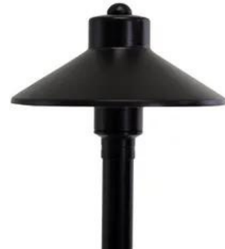
VOLT® Flat Hat Black Brass Path & Area Light (7" Shade)

The fixture provides a generous spread of soft-edged illumination ideal for all types of paths and landscape features. Easy to assemble and install. Various mounting options available. 12 foot spread of light.