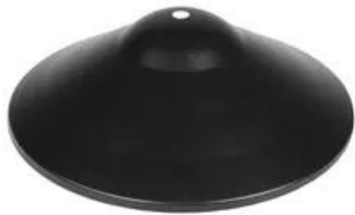
VOLT® Max Spread 9" Hat (Brass, Black Finish)

Shade ONLY, does not include lamp housing or finial.