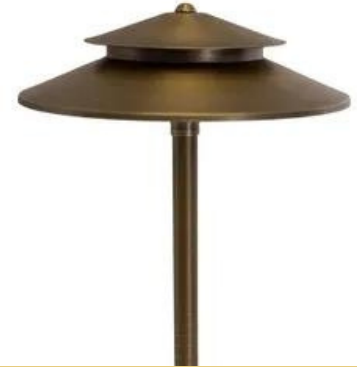
VOLT® Stratum Brass Two-Tier Path & Area Light (12" Shade)

This Two-Tier Path & Area Light is a high-quality outdoor lighting fixture that projects a wide circle of uniform illumination. With a 9" diameter shade, this is the little brother of the 12" Stratum. Both fixtures have clean, modern lines with a traditional pagoda-like shape - ideal for gardens with Asian themes, but also works for properties with landscape structures such as gazebos, pergolas and arbors.