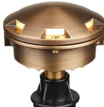
VOLT® Salty Dog Single Source Integrated LED Turret Top In-Grade Light

Introducing our most advanced, fully submersible, single source Integrated LED, in-grade light. This model features a fixed grated glare guard to control direct glare. We've redesigned the in-grade light from the ground up - starting with a cold forged brass body, pressure fit gaskets, new watertight wire glands and the latest integrated LED technology. Our Salty Dog well lights are the first of their kind that can be fully submerged without risk of damaging the fixture. Finally, a fixture that you can install with the utmost confidence in areas prone to flooding!