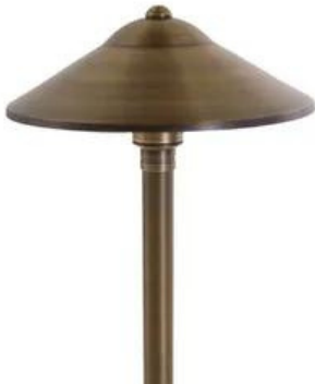
VOLT® Max Spread Brass Path & Area Light

Substantially proportioned for wider and longer paths, the large shade with a shallow angle and tall post all equate to wider regions of illumination. The Max Spread Area Path light can save you money by reducing the number of lights needed. Includes the VOLT® Hammer® Stake. Various mounting options available. 16 foot diameter beam spread.