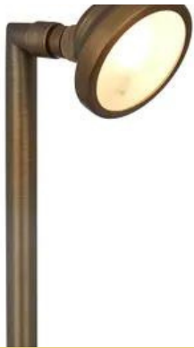
VOLT® Elevator Cast Brass Path and Flood Light (Bronze)

Sleek and adjustable brass floodlight elevated for optimal spread.