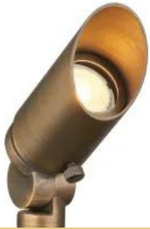
VOLT® All-Star™ Mini Brass Spotlight (Bronze)

Solid cast brass niche spotlight. Ideal for mounting in planters, garden areas, or other places where a compact and discreet fixture is required.