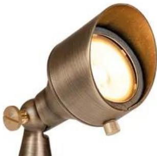
VOLT® Lucid Brass Spotlight (Bronze)

The most affordable all-brass spotlight on the market. Features premium internal components and fully-adjustable glare guard and knuckle for precision control. A great solution for any budget without sacrificing professional-grade quality.