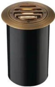
VOLT® Salty Dog MR11 Grated Brass Well Light (Bronze)

Introducing our most compact, fully submersible, lamp-ready well light. This model features a fixed glare guard to control direct glare. The VOLT® Salty Dog MR11 Well Light is a low voltage outdoor professional-grade well light. Great for up lighting on trees, columns, walls, and anything where a low profile outdoor well light fixture is desired. Featuring an adjustable lamp-ready internal housing that can move up, down and give you a directional angle for precise aiming. Cold forged brass with a reinforced PVC canister. Completely waterproof.