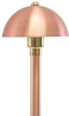
VOLT® Mushroom Copper Path & Area Light

High-quality path/area light with mini-sized Flat Hat. Includes Hammer® Stake. Various mounting options available. 6-foot spread of light.