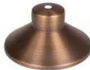
VOLT® Flat Hat 5" Shade (Brass with Bronze Finish)

Solid Brass Construction. Designed to mount on VOLT stems.