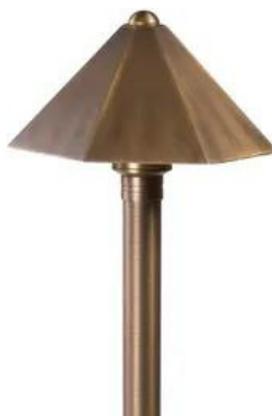
VOLT® Parasol Brass Path & Area Light (Bronze)

The Premier Pagoda takes the classic tiered design and updates it with user-friendly functionality. With solid brass construction and updated aesthetics this fixture, looks good both day and night.