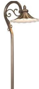
VOLT® Elegant Harp Brass Path & Area Light (Bronze)

This path and area light combines the tall stem of a path light with the directionality of two spotlights. Allows you to illuminate two regions with a single fixture. Various mounting options available.