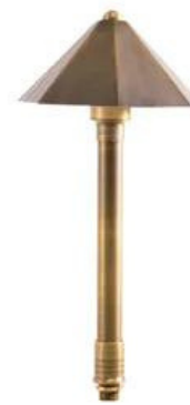
VOLT® Mini Parasol Brass Path & Area Light (Bronze)

The fixture provides a generous spread of soft-edged illumination ideal for all types of paths and landscape features. Various mounting options available. 12 foot spread of light.