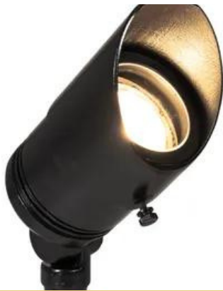
VOLT® All-Star™ Cast Brass Spotlight (Black)

Compact and durable, this heavyweight solid cast brass landscape lighting spotlight uses a VOLT® MR8 LED bulb (sold separately). This fixture is ideal for niche applications such as garden lighting, illuminating statuary or small architectural or landscape features.