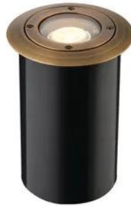
VOLT® Salty Dog MR11 Brass Well Light (Bronze)

Introducing our most compact, fully submersible, lamp-ready in-grade light. This model features a fixed, turret top glare guard to control direct glare. We've redesigned the in-grade light from the ground up - starting with a cold forged brass body, pressure fit gaskets, new watertight wire glands and lamp ready capability for a wide array of MR11 lamps. Our Salty Dog in-grade lights are the first of their kind that can be fully submerged without risk of damaging the fixture.