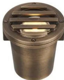
VOLT® Salty Dog MR11 Grated Brass In-Grade Light (Bronze)

We've redesigned the in-grade light from the ground up - starting with a cold forged brass body, pressure fit gaskets, new watertight wire glands, and lamp ready capability for a wide array of LED MR11 lamps. Our line of "Salty Dog" in-grade lights are the first of its kind that can be fully submerged without risk of damaging the fixture.