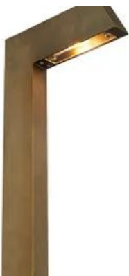
VOLT® Modernelle Brass Path & Area Light

This Two-Tier Path & Area Light is a high-quality outdoor lighting fixture that projects a wide circle of uniform illumination. With a 12" diameter shade, this is the big brother of the 9" Stratum. Both fixtures have clean, modern lines with a traditional pagoda-like shape - ideal for gardens with Asian themes, but also works for properties with landscape structures such as gazebos, pergolas and arbors.