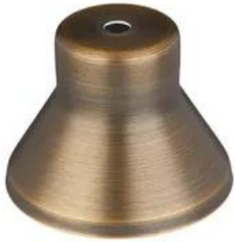
VOLT® Flat Hat 3" Shade (Brass with Bronze Finish)

Shade ONLY, does not include lamp housing or finial. Solid Brass Construction. Designed to mount on VOLT stems.