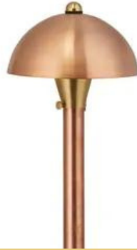
VOLT® Mini Mushroom Copper Path & Area Light

The key difference between the Brass Flat Hat 5" Light and the mini version is the 12.5" tall stem, making the overall height of the fixture 15". An excellent choice when you want a very low path & area light. Features a 4.5-foot spread of light. Various mounting options available.