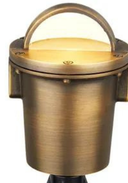
VOLT® Salty Dog MR16 Beacon In-Grade Light

Our most advanced, fully submersible, lamp-ready in-grade light. This model features a fixed, grated glare guard to control direct glare. The VOLT® Salty Dog MR16 In-Grade Light is a professional-grade, completely waterproof in-grade light with a cold forged brass body, pressure fit gaskets, new watertight wire glands, and lamp ready capability for a wide array of LED MR16 lamps. Our line of "Salty Dog" in-grade lights are the first of its kind that can be fully submerged without risk of damaging the fixture.