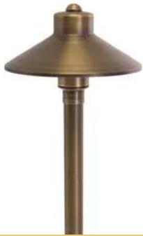
VOLT® Flat Hat Brass Path & Area Light (7" Shade)

A popular and classic style, this solid brass path/area light adds beauty and security to any landscape.