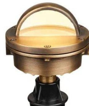
VOLT® Salty Dog Single Source Integrated LED Beacon In-Grade Light

Introducing our most advanced, fully submersible single source integrated LED in-grade light. This model features a fixed turret top glare guard to control direct glare. We've redesigned the in-grade light from the ground up - starting with a cold forged brass body, pressure fit gaskets, new watertight wire glands, and the latest integrated LED technology. Our Salty Dog in-grade lights are the first of their kind that can be fully submerged without risk of damaging the fixture. Finally, a fixture that you can install with the utmost confidence in areas prone to flooding!