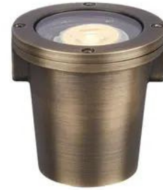
VOLT® Salty Dog MR11 Brass In-Grade Light (Bronze)

Fully adjustable PAR36 well light - move lamp up/down and angle direction of light using the stainless steel adjustable bulb holder (gimbal). Reversible design; use angle side or flat/flush mount side of PVC tube. Unbeatable price for a professional grade well light.