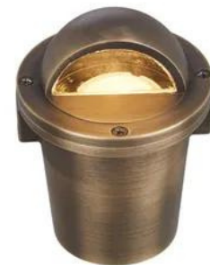
VOLT® Salty Dog MR11 Beacon Brass In-Grade Light (Bronze)

We've redesigned the in-grade light from the ground up - starting with a cold forged brass body, pressure fit gaskets, new watertight wire glands and lamp ready capability for a wide array of MR11 lamps. Our Salty Dog in-grade lights are the first of their kind that can be fully submerged without risk of damaging the fixture.