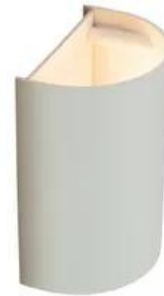
VOLT® Cast Brass Up/Down Integrated LED Deck Light (White)

Introducing the Revolutionary Up/Down Integrated LED Deck Light. The Up/Down Deck Light is a distinctive and elegant cast brass fixture that offers the benefits of a compact deck light along with the beauty and functionality of an up/down sconce. This fixture is ideal for posts on gazebos and arbors, and for wall mounting along steps, stairs and entryways. The unit is also ideal for mounting on columns and pillars.