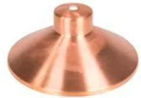
VOLT® Conehead 7" Hat (Copper)

Solid Brass Construction. Designed to mount on VOLT stems.