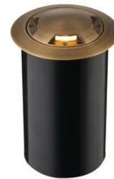
VOLT® Salty Dog MR11 Beacon Brass Well Light (Bronze)

Introducing our most compact, fully submersible, lamp-ready well light. This model features a beacon glare guard to control direct glare. The VOLT® Salty Dog MR11 Well Light is a low voltage outdoor professional-grade well light. Great for up lighting on trees, columns, walls, and anything where a low profile outdoor well light fixture is desired. Featuring an adjustable lamp-ready internal housing that can move up, down and give you a directional angle for precise aiming. Cold forged brass with a reinforced PVC canister. Completely waterproof.