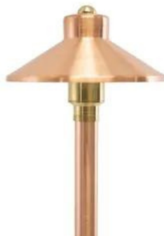
VOLT® Flat Hat Copper Path & Area Light (7" Shade)

The fixture provides a generous spread of soft-edged illumination ideal for all types of paths and landscape features. Easy to assemble and install. Various mounting options available. 12 foot spread of light.