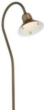
VOLT® Traditions Brass Path & Area Light

The VOLT® Elegant Harp Path and Area Light is a high quality fixture with a traditional bishop's arch, scroll and fluted shade for an ornate appearance that complements traditional or classical architecture. Pairs well with landscape features such as gazebos, pergolas, formal gardens, and small cottages or sheds that are whimsical or ornate.