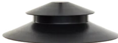
VOLT® Stratum 9" Double Tiered Hat (Brass with Black Finish)

Shade ONLY, does not include lamp housing or finial. Solid Brass Construction. Designed to mount on VOLT stems.