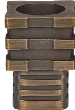
VOLT® Decorative Modern Style Arm

New extra robust brass design for added stability and durability. Polynesian-style fixture with flame and LED bulb make this a multi-functional light. Perfect for decks and docks, these tropical fixtures create a festive easy-going atmosphere while providing area lighting for safety and security.