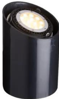
VOLT® Ground Hog PVC PAR36 In-Ground Well Light

This professional quality well light features a solid cast brass top with grate. A glass convex lens is attached under the grate to keep out debris. Four other lenses and louvers are included. Ideal for mounting in driveways, turf areas or in hardscape applications.