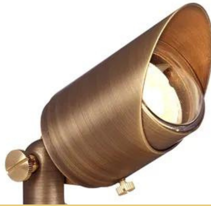
VOLT® Top Dog Cast Brass Spotlight (Bronze)

We combined the best features of our most popular spotlights into one premium fixture that features a compact body with fins designed to draw heat away from the LED lamp. Blending performance and durability, this fixture is a designer's dream.