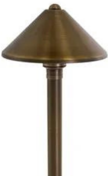
VOLT® Conehead Brass Path & Area Light

Substantially proportioned for wider and longer paths, the large shade with a shallow angle and tall post all equate to wider regions of illumination. The Max Spread Area Path light can save you money by reducing the number of lights needed. Includes the VOLT® Hammer® Stake. Various mounting options available. 16 foot diameter beam spread.