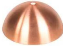
VOLT® Mushroom 7" Hat (Copper)

Shade ONLY, does not include lamp housing or finial. Solid Brass Construction. Designed to mount on VOLT stems.