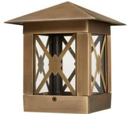
VOLT® Guardsman Brass LED Post-Top Light (Bronze)

This is the finest up/down sconce in the low voltage landscape lighting industry. Glass has etched edges that prevent any water from puddling or collecting on top. Body is threaded and screws together tight to make it completely waterproof.