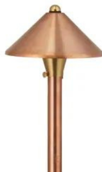
VOLT® Mini Conehead Copper Path & Area Light

Substantially proportioned for wider and longer paths, the large shade with a shallow angle and tall post all equate to wider regions of illumination. The Max Spread Mini Area Path Light has an 8-foot diameter spread of light - the largest of all our mini path and area lights. Various mounting options available.