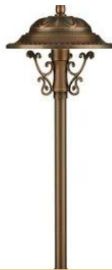
VOLT® Regal Brass Path & Area Light (Bronze)

Due to the tilted shade, this elegant fixture casts a forward-facing light about 14 feet - a great solution for wide paths or garden beds. Comes with 4' lead wire and Hammer® Stake standard. Various mounting options available.