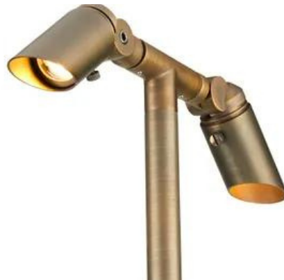
VOLT® Mini All-Star™ Twinnovator Brass Path & Area Light (Bronze)

Our VOLT® Elevator brass fixture is great for floodlighting or path lighting applications. It features an adjustable knuckle and frosted lens to create an extra-wide, highly diffuse beam with soft edges. Ideal for natural illumination on walls and plants.