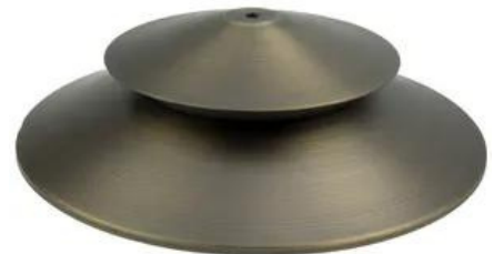
VOLT® Stratum 12" Double Tiered Hat (Brass with Bronze Finish)

Shade ONLY, does not include lamp housing or finial. Solid Brass Construction. Designed to mount on VOLT stems.