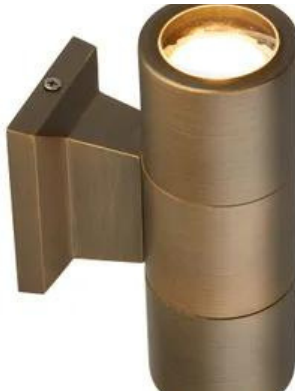
VOLT® Ultra Premium Cast Brass Up/Down Sconce

Durable, low profile, linear fixtures designed to be easily concealed. Perfect for a variety of applications. They are easy to install, produce an evenly dispersed illumination and are rotatable 360° for maximum customization.