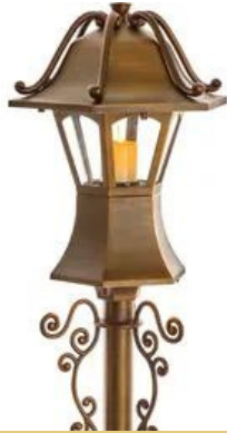
VOLT® Coachman LED Brass Path & Area Light (Bronze)

One-of-a-kind coach-style post light with plug-in LED candle and hidden area light. Standing over 62" tall, this estate-sized luminaire serves as a welcoming lantern in your front or back yard. Featuring an ultra-realistic LED BiPin candle (with moving flame), and a hidden LED lamp under the housing - this light is both beautiful and functional. Ideal for larger homes and properties - but also perfectly suited for a smaller traditional home. Patented.