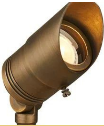
VOLT® All-Star™ Cast Brass Spotlight (Bronze)

VOLT®'S flagship brass spotlight is designed for durability and flexibility. Uses replaceable MR16 LED bulbs for wide selection of color temperatures, wattages and beam angles.