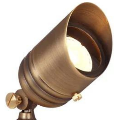
VOLT® G2 Fat Boy Brass Spotlight (Bronze)

A popular choice for professionals. Very versatile. Large glare guard adjusts up, down, left and right to adjust light spread and glare control. Several mounting options.