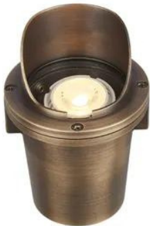
VOLT® Salty Dog MR11 Shielded Brass In-Grade Light (Bronze)

We've redesigned the in-grade light from the ground up - starting with a cold forged brass body, pressure fit gaskets, new watertight wire glands, and lamp ready capability for a wide array of LED MR11 lamps. Our line of "Salty Dog" in-grade lights are the first of its kind that can be fully submerged without risk of damaging the fixture.