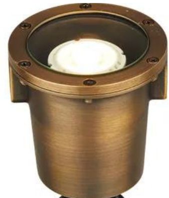
VOLT® Salty Dog MR16 Shielded In-Grade Light

Our most advanced, fully submersible, lamp-ready in-grade light. The VOLT® Salty Dog MR16 In-Grade Light is a professional-grade, completely waterproof in-grade light with a cold forged brass body, pressure fit gaskets, new watertight wire glands, and lamp ready capability for a wide array of LED MR16 lamps. Our line of "Salty Dog" in-grade lights are the first of its kind that can be fully submerged without risk of damaging the fixture.