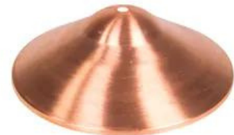
VOLT® Max Spread 9" Hat (Copper)

Solid Brass Construction. Designed to mount on VOLT stems.