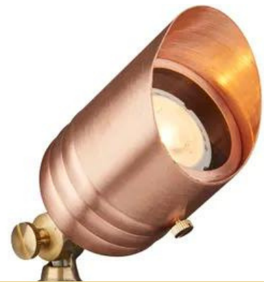
VOLT® G2 Fat Boy Copper Spotlight

The most affordable all-brass spotlight on the market. Features premium internal components and fully-adjustable glare guard and knuckle for precision control. A great solution for any budget without sacrificing professional-grade quality.