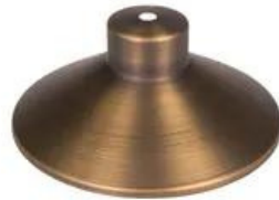
VOLT® Conehead 7" Hat (Brass with Bronze Finish)

Solid Brass Construction. Designed to mount on VOLT stems.