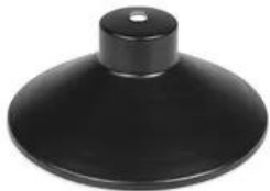
VOLT® Flat Hat 7" Shade (Brass with Black Finish)

Solid Brass Construction. Designed to mount on VOLT stems.