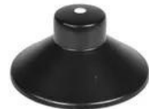
VOLT® Flat Hat 5" Shade (Brass with Black Finish)

Solid Brass Construction. Designed to mount on VOLT stems.