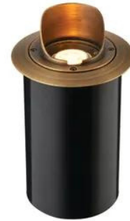
VOLT® Salty Dog MR11 Shielded Brass Well Light (Bronze)

Introducing our most compact, fully submersible, lamp-ready well light. The VOLT® Salty Dog MR11 Well Light is a low voltage outdoor professional-grade well light. Great for up lighting on trees, columns, walls, and anything where a low profile outdoor well light fixture is desired. Featuring an adjustable lamp-ready internal housing that can move up, down and give you a directional angle for precise aiming. Cold forged brass with a reinforced PVC canister. Completely waterproof.