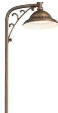
VOLT® Belladonna Brass Path & Area Light (Bronze)

VOLT® Regal Path & Area Lights are professional grade fixtures with an ornate appearance that complements many architectural and landscape styles. The elegant scroll, decorative shade, and classic finial bring a touch of regality to your landscape.