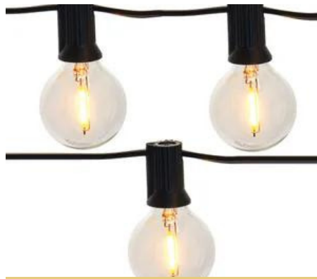
VOLT® 120V E12 Bistro String Lights (50ft)

Replacement LED 120V bulbs for VOLT® E26 Bistro Lights. Consuming only 0.5 watts, these globe bulbs provide the perfect soft low-level light for the Bistro Strings. The warm white color temperature (2200K) provide a pleasant glow that bathes the entire scene in a comfortable illumination.