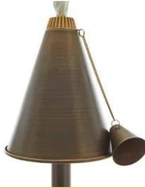
VOLT® 2 in-1 Tiki Brass Torch Light (Bronze)

One-of-a-kind coach-style post light with plug-in LED candle and hidden area light. Standing over 62" tall, this estate-sized luminaire serves as a welcoming lantern in your front or back yard. Featuring an ultra-realistic LED BiPin candle (with moving flame), and a hidden LED lamp under the housing - this light is both beautiful and functional. Ideal for larger homes and properties - but also perfectly suited for a smaller traditional home. Patented.