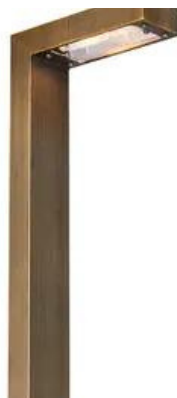
VOLT® Wide Modernelle Brass Path & Area Light

The VOLT® Modernelle Path and Area Light is a professional-grade LED fixtures with a modern style. Constructed of heavyweight solid brass, the fixture is a durable lifetime solution to your path lighting needs. Standard 4' lead wire. Includes Hammer® Stake. Various mounting options available.