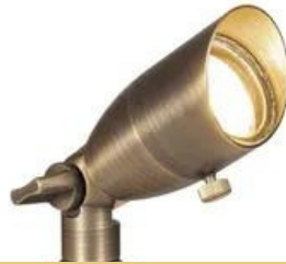
VOLT® Jolt Mini Brass Spotlight (Bronze)

Compact and durable, this heavyweight solid cast brass landscape lighting spotlight offers many uses. Uses replaceable MR11 LED bulbs. This fixture is ideal for niche applications such as garden lighting, illuminating statuary or small architectural or landscape features.