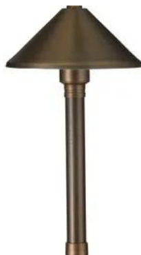
VOLT® Mini Conehead Brass Path & Area Light

High quality path/area light. 4' standard lead wire. Includes Hammer® Stake. Various mounting options available. 12 foot spread of light.