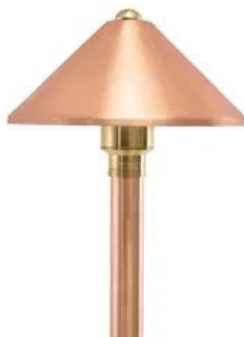
VOLT® Conehead Copper Path & Area Light

Professional quality durable path/area light. Easy to assemble and install. 12-foot diameter illumination - evenly dispersed and soft-edged.