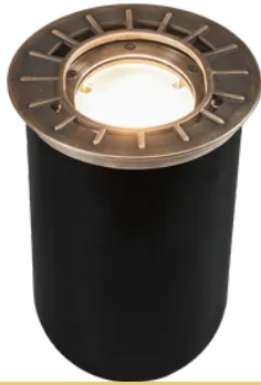
VOLT® Salty Dog Single Source Integrated LED Well Light

Introducing our most advanced, fully submersible, integrated LED well light. This professional-grade low voltage well light is great for uplighting trees, columns, walls and more. Its adjustable, fully-integrated LED internal lamp housing can move up or down, and provides a directional angle for precise aiming. This completely waterproof fixture features a cold forged brass faceplate with a reinforced PVC canister.