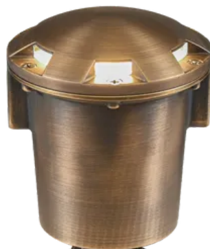
VOLT® Salty Dog MR16 Turret Top In-Grade Light

Our most advanced, fully submersible, lamp-ready in-grade light. This model features a fixed, grated glare guard to control direct glare. The VOLT® Salty Dog MR16 In-Grade Light is a professional-grade, completely waterproof in-grade light with a cold forged brass body, pressure fit gaskets, new watertight wire glands, and lamp ready capability for a wide array of LED MR16 lamps. Our line of "Salty Dog" in-grade lights are the first of its kind that can be fully submerged without risk of damaging the fixture.