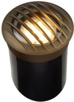
VOLT® Commercial PAR36 In-Ground Well Light

Well light with solid cast brass top with grate and convex glass lens. Strong enough for drive-overs. Available with wide variety of waterproof LED PAR36 bulbs.